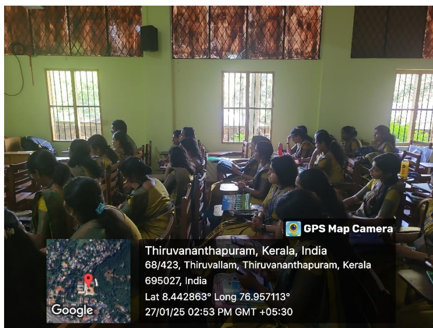
Fig6: Students actively participating in the session