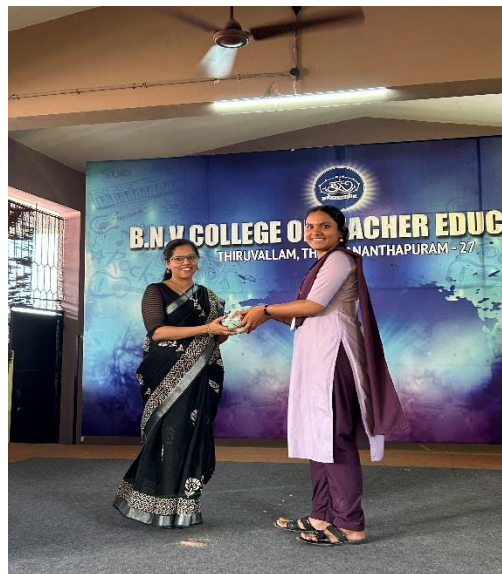
Fig:9 Third prize winner