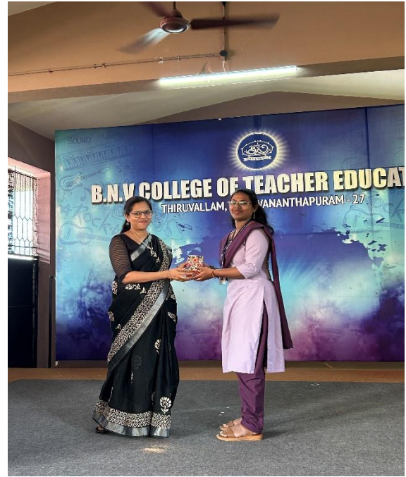
Fig:8 Second prize winner