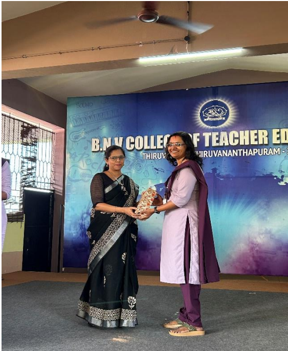
Fig:7 First prize winner