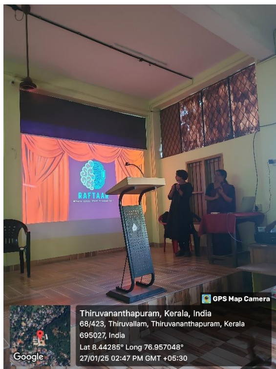
Fig4: Logo launch