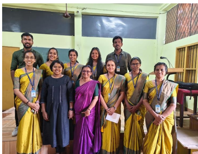
Fig 2: Our club members with the resource person