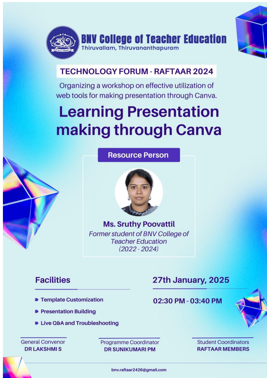
Fig 1: The Brochure

Raftaar organizes a range of activities for the student teachers and started this year's programs by a workshop on effective utilization of web tools for making presentation through canva.